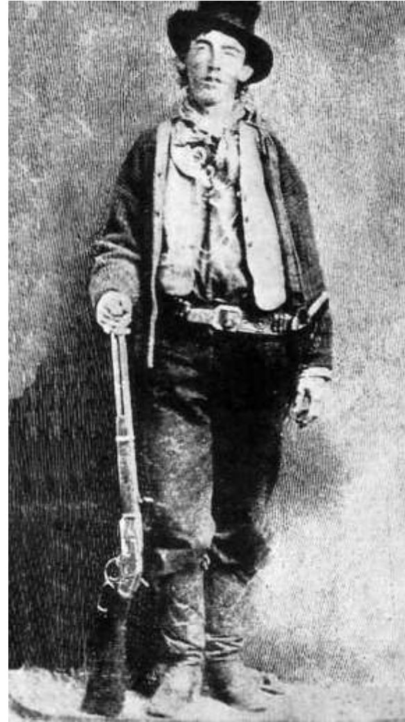
Billy the Kid