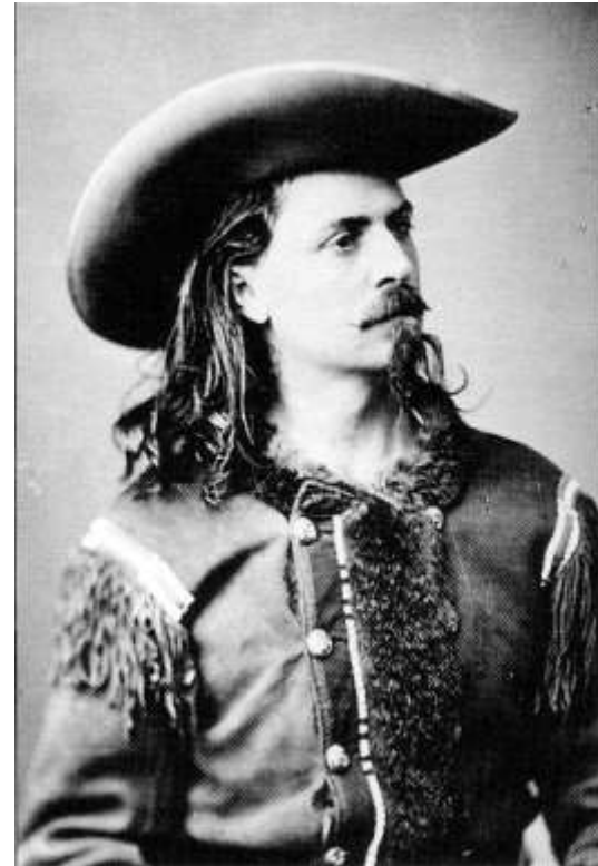
William F. Cody 1846-1917